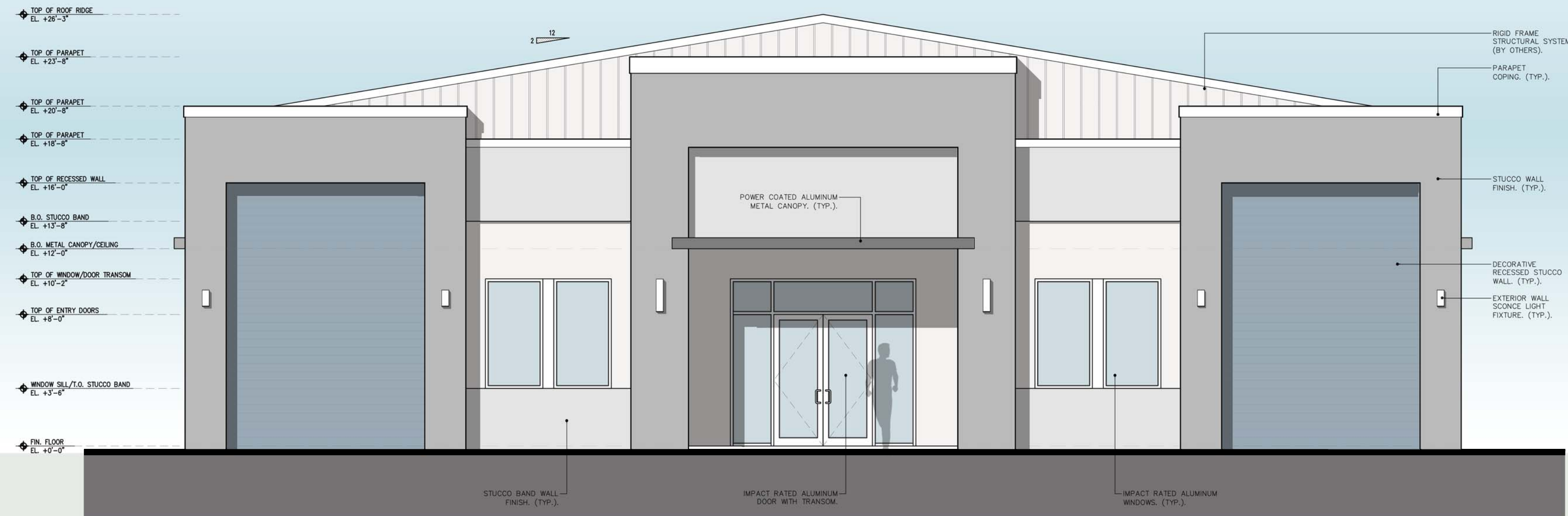
1 Proposed North Elevation :: Front SCALE: 3/16"=1'-0"